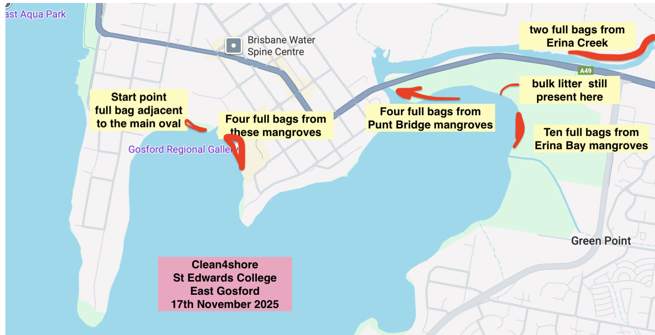
Today's Field Trip Site

More reports on Clean4shore facebook & Instagram