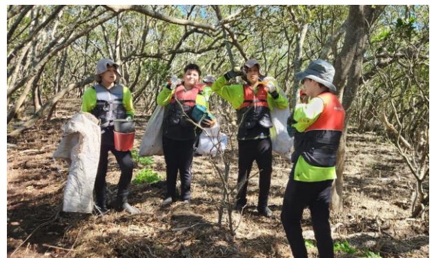
Full bags in Erina Bay

This Project received Grant funding from the Australian Government through the Environment Restoration Fund.