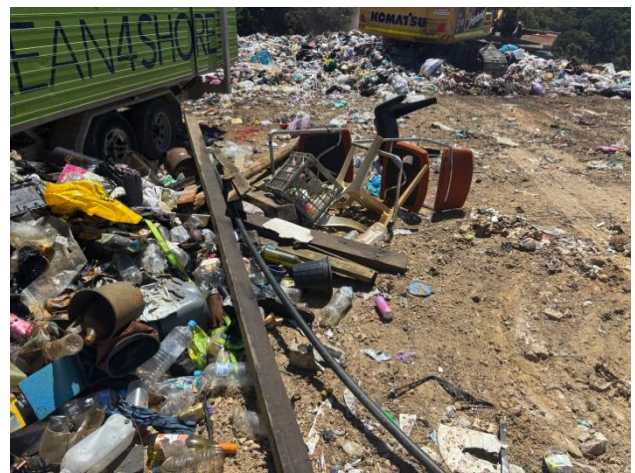
Today's rubbish delivered to Woy Woy Tip