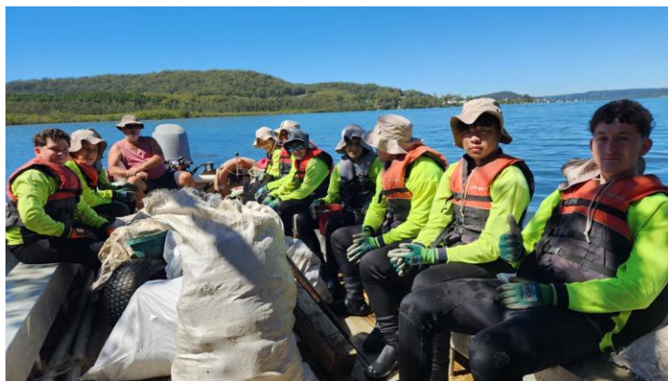
Good load on the barge returning home