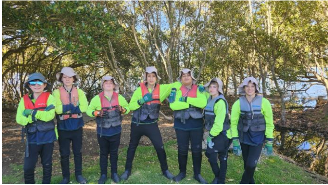
Confident boys ready for the challenge