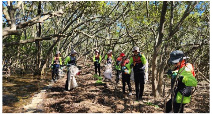
More big bags at Punt Bridge