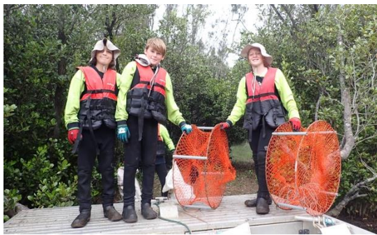
Crab traps, illegal in these waters

Today's field trip into Erina Creek by St Edwards College East Gosford