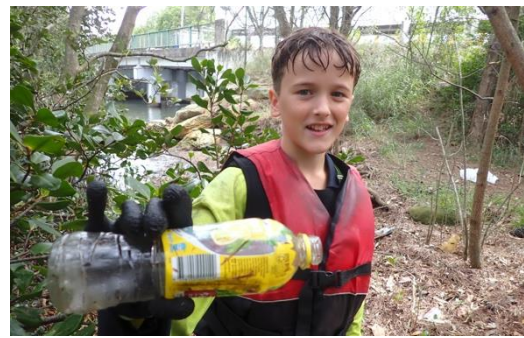
Bar Coded bottles in big numbers!