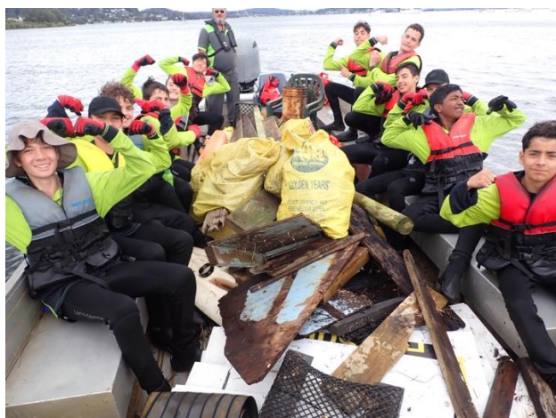
Big load in the barge for the return trip