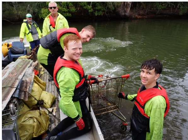
Trolley coming out behind the factory bays