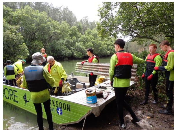
First campsite being cleaned by the team