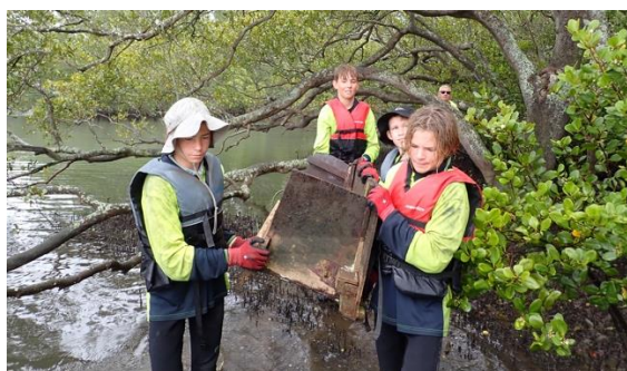
Marine timber from the Puntb bridge boat