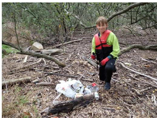
Plenty of recyclable cans now being thrown out