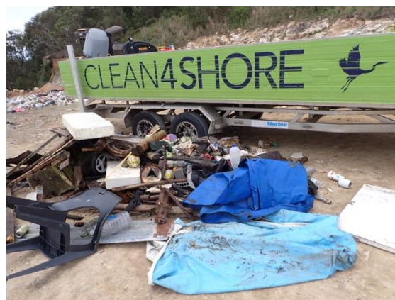
Today's big load at Woy Woy Tip