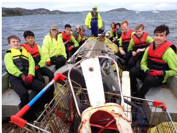
Big load returning to St Edwards College