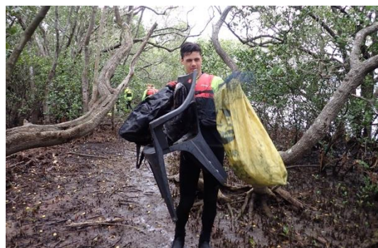
Punt Bridge rubbish coming out