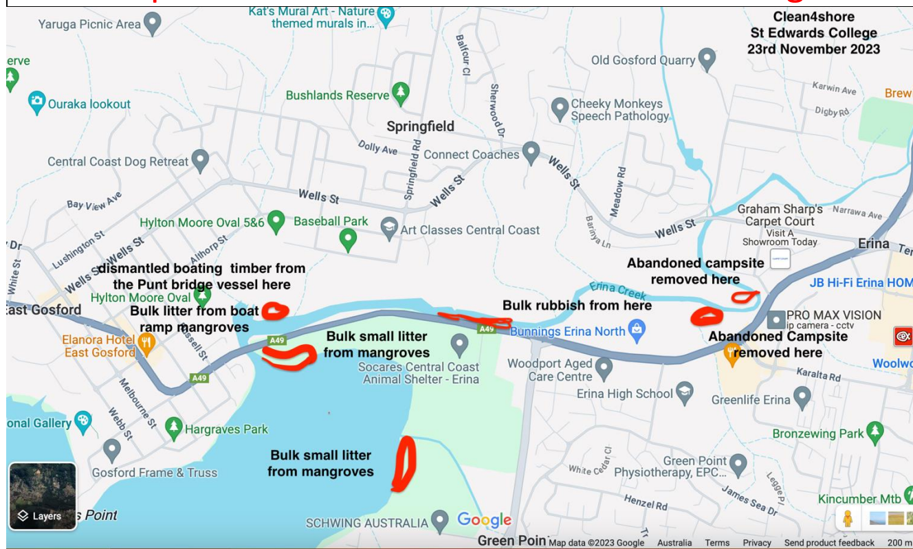
Today's field trip site with the St Edwards College team

More reports on Clean4shore facebook & Instagram