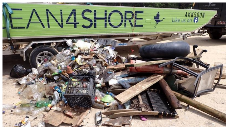
Big offload at Woy Woy Tip from the 24 full bags