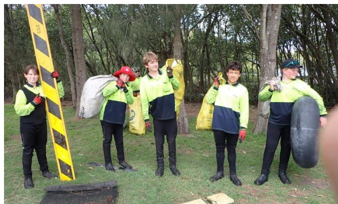
Five full bags from the College mangroves