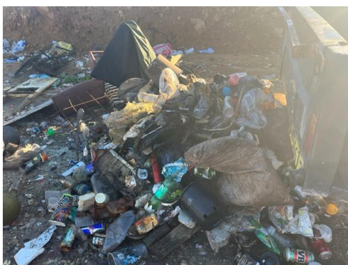
Today's rubbish delivered

This Project received Grant funding from the Australian Government through the Environment Restoration Fund.