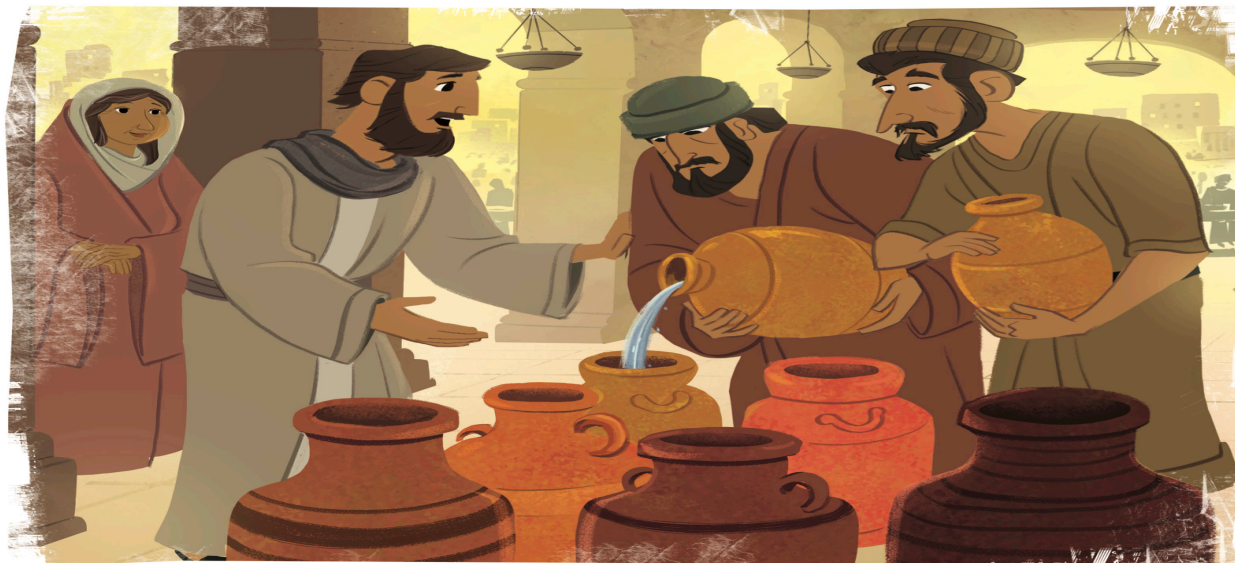
Jesus Turned Water to Wine (John 2:1-12) • Unit 23, Session 1 • © 2017 LifeWay OK to Print

Jesus and these new disciples would travel a lot. In Galilee they stopped at Nathanael's hometown of Cana. There Jesus went to a big wedding feast and performed his first miracle. He turned water into wine.