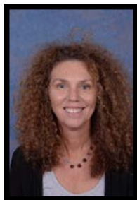
Terasa Killin Counsellor T. 4321 6411