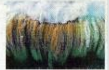
Avoca Beach wave

#SnapCoast says thank you to our national partners Canon Australia and Harvey Norman Photo Centre